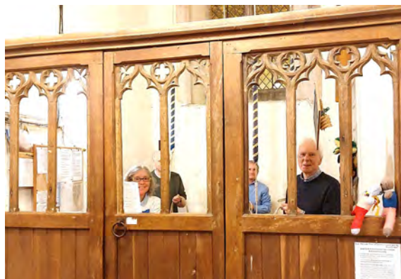
The Bell Ringing Band who are looking forward to the installation of two new bells in December

During the year, thanks to your generosity, we have been able to support the project to enhance the bell tower from a peal of four to a peal of six. The two new bells have now been cast, and you can see videos and photos of the casting process on the FOALs Facebook page. These new bells will have been on display in the church for the Christmas Tree Festival on Saturday 2 nd & Sunday 3 rd December. They are then to be lifted and hung in the tower in time to ring for Christmas!